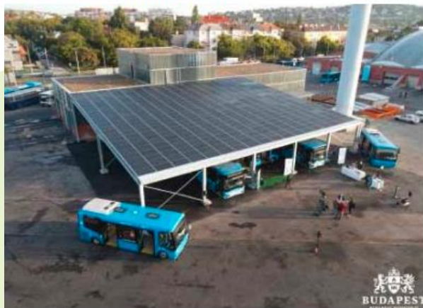
Solar-powered bus storage facility in Budapest