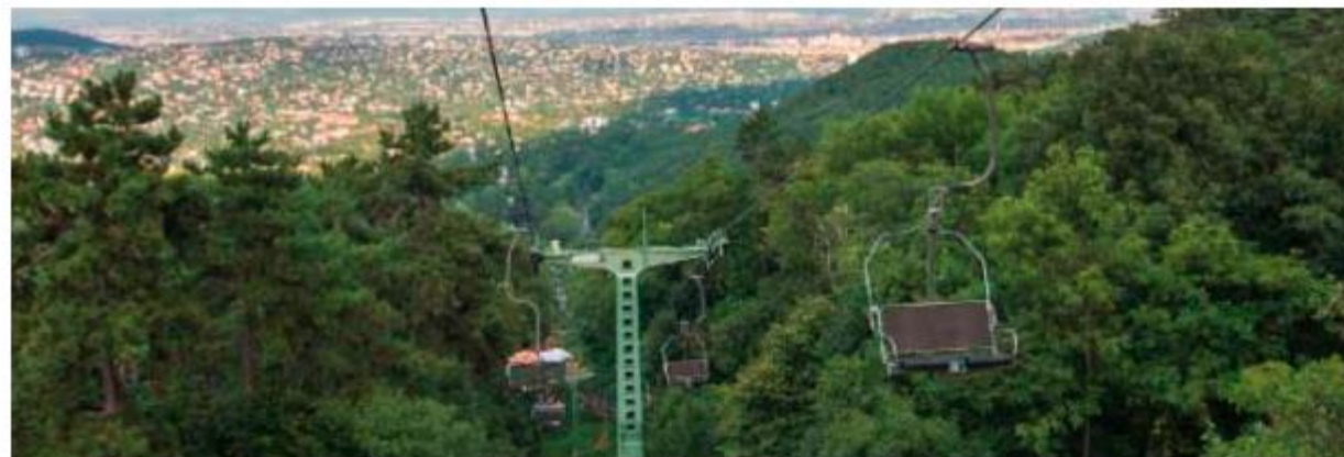
World Bid Book of Budapest, Hungary